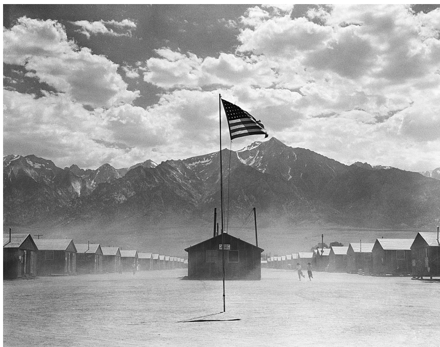
Manzanar, California, 1942. U.S. War Relocation Authority camp, where evacuees of Japanese ancestry, including United States citizens, spent the duration of World War II.